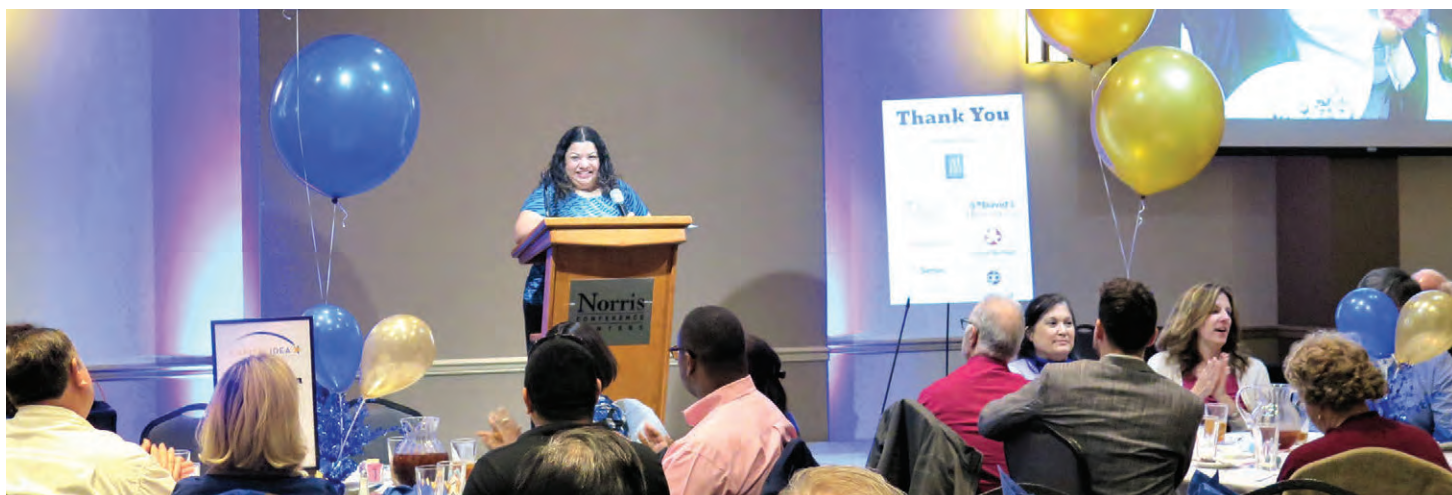
Capital IDEA's annual Celebration of Achievements Luncheon honoring the graduates of 2018. Norris Conference Center, February 28, 2019.