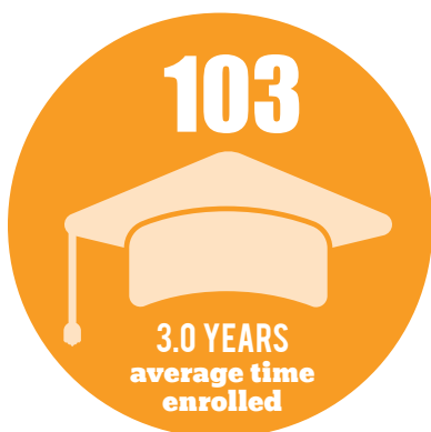
DEGREES & CERTIFICATES

Our goal is to place students in career fields and starting positions that make use of the knowledge and skills they have acquired, even if they leave the program early without graduating. In 2018, 17 of the 107 job placements were placed early. Their income is included in the average starting wage.